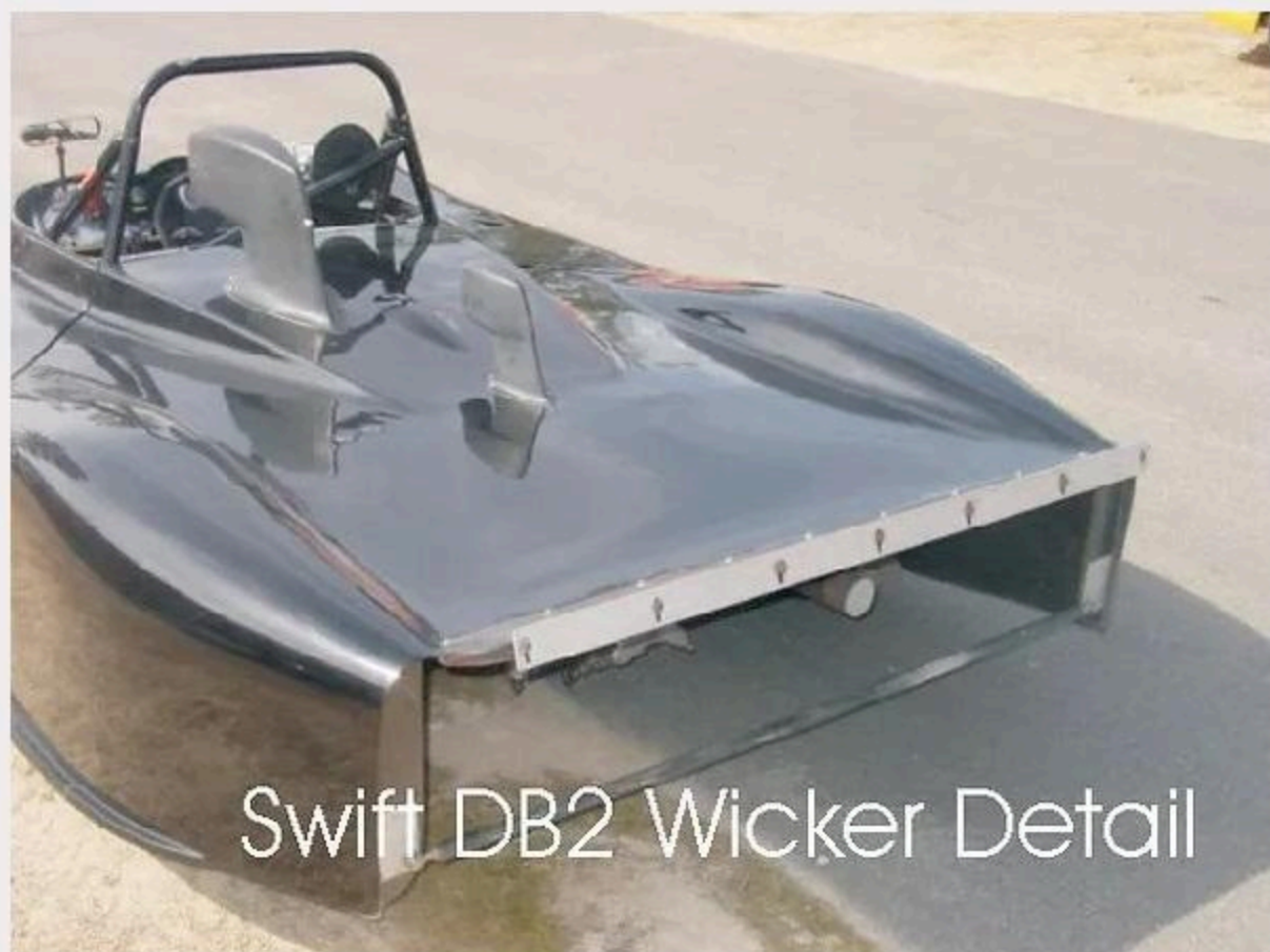
Swift DB2 Wicker Detail