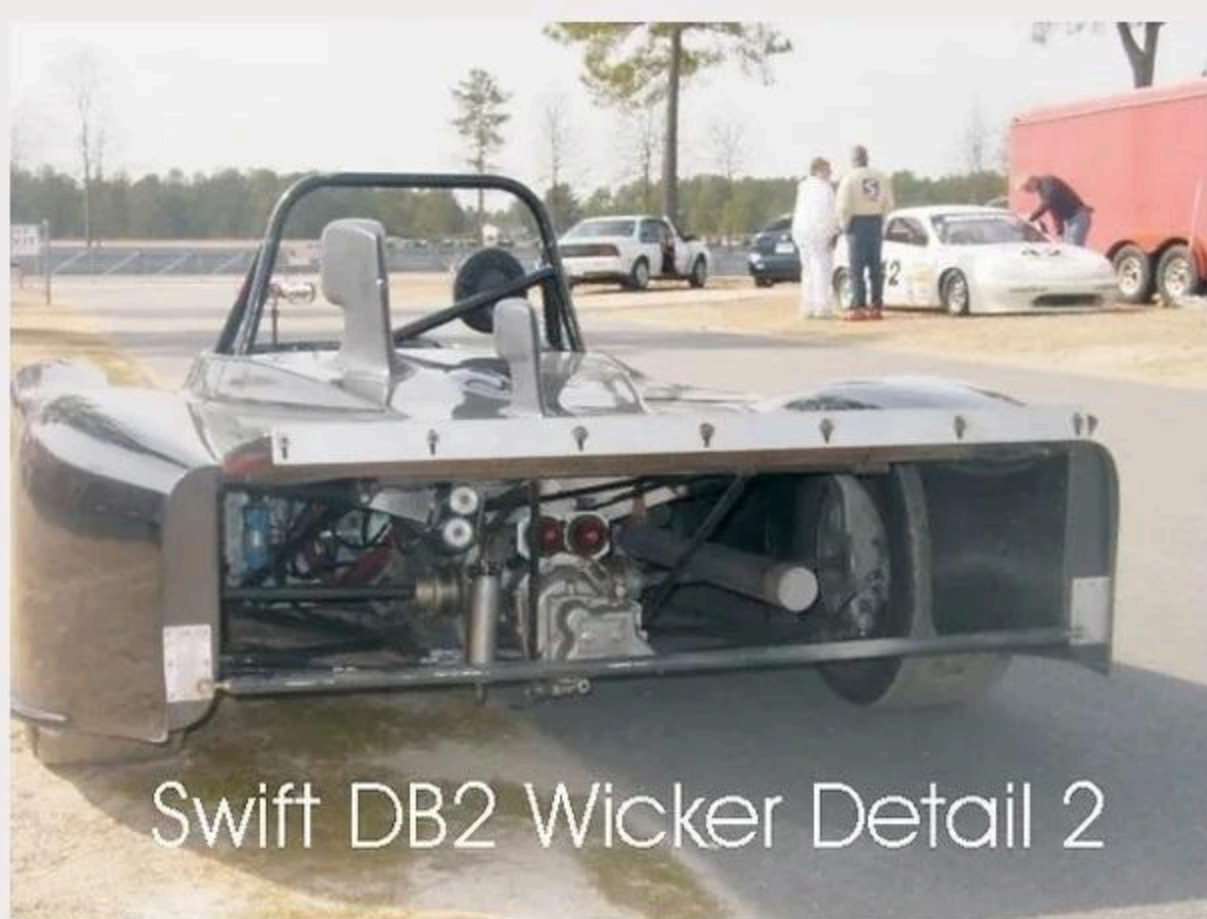
Swift DB2 Wicker Detail 2